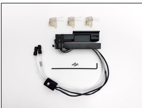
MICRON Mouse - Pro Upgrade Kit