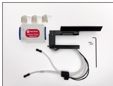
MICRON Rat - Pro Upgrade Kit

Upgrade Kits are available for the MICRON Animal Stand-Standard!