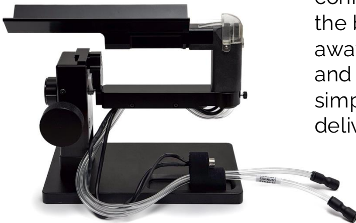
MICRON Animal Stand - Pro - Rat

With the MICRON Animal Stand - Pro , for the first time, inhalation anesthetic delivery is integrated into a platform specifically designed for in vivo ophthalmic imaging of small animals.