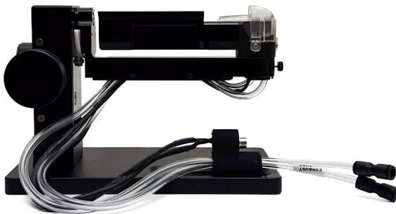
MICRON Animal Stand - Pro - Mouse

With the MICRON Animal Stand - Pro , for the first time, inhalation anesthetic delivery is integrated into a platform specifically designed for in vivo ophthalmic imaging of small animals.